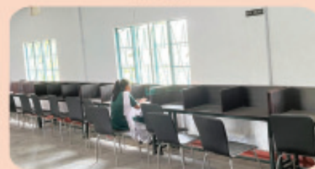
Reading Room for Students