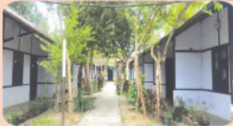
Assam Type Old Girls' Hostel