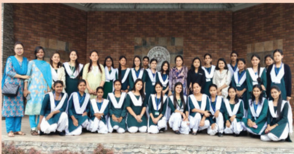
A field trip to Tezu (3/4/2025)