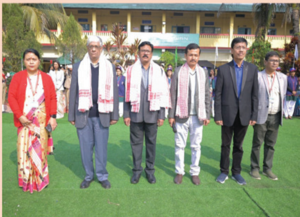
NAAC Peer Team Visit (21-01-2025 & 22-01-2025)