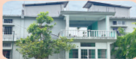
New Girl's Hostel