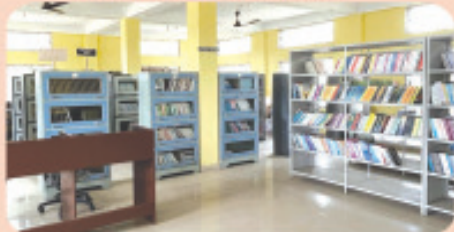
Reference Book Section Library