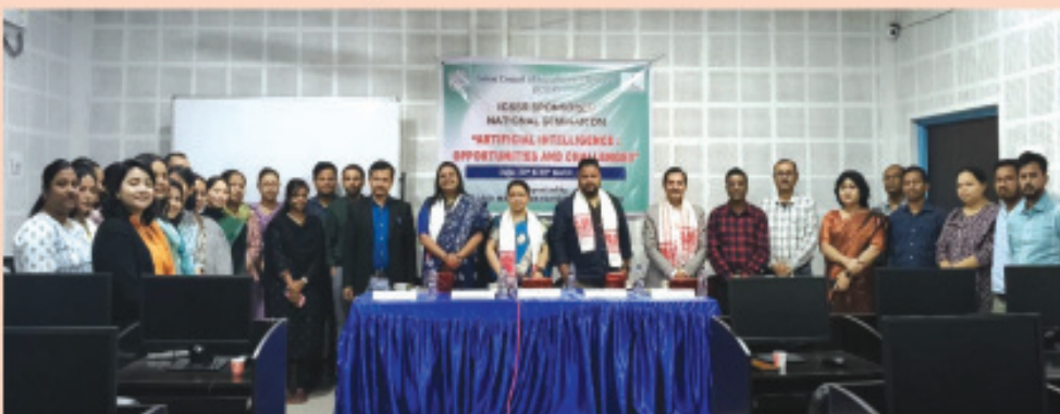
National Seminar on Artificial Intelligence (Date: 29th and 30th March)