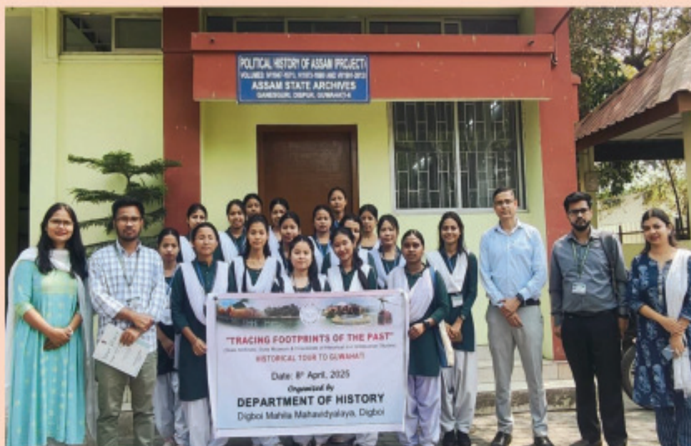
An Educational Tour to Guwahati (8-04-2025)