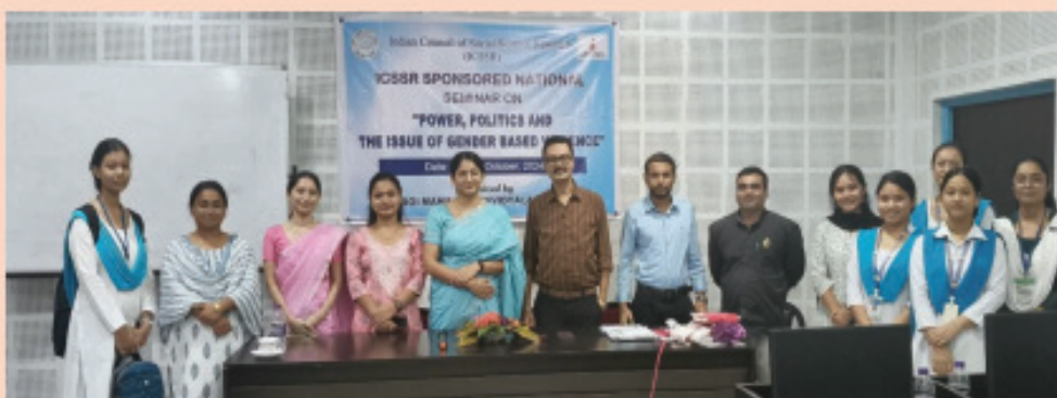
National Seminar on Power, Politics and the Issues of Gender Based Violence (Date: 5th and 6th October.