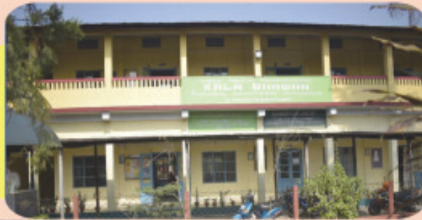
Kala Bhawan, College building