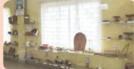
Indigenous Artefacts Museum