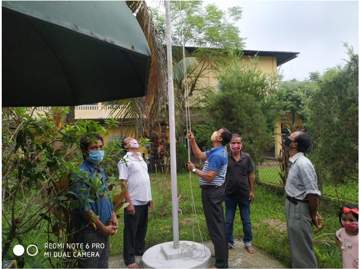
Celebration of Independence Day at Digboi Mahila Mahavidyalaya