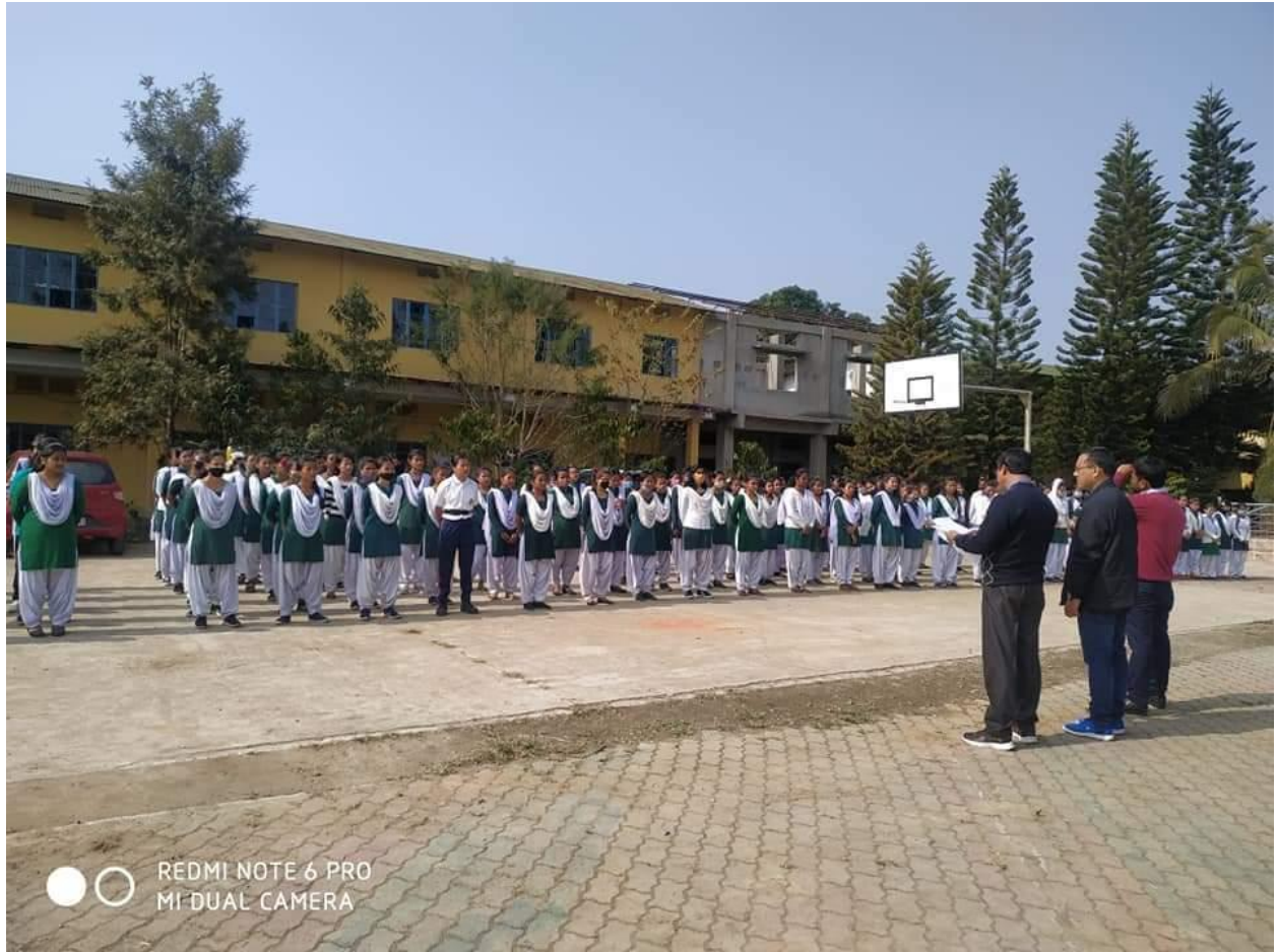
Observance of National Voters' Day at Digboi Mahila Mahavidyalaya