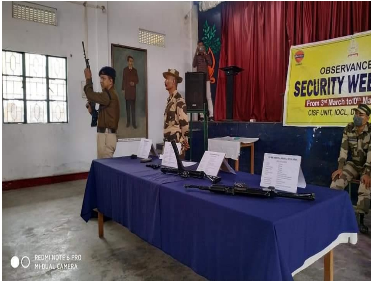
Observance of Security Week