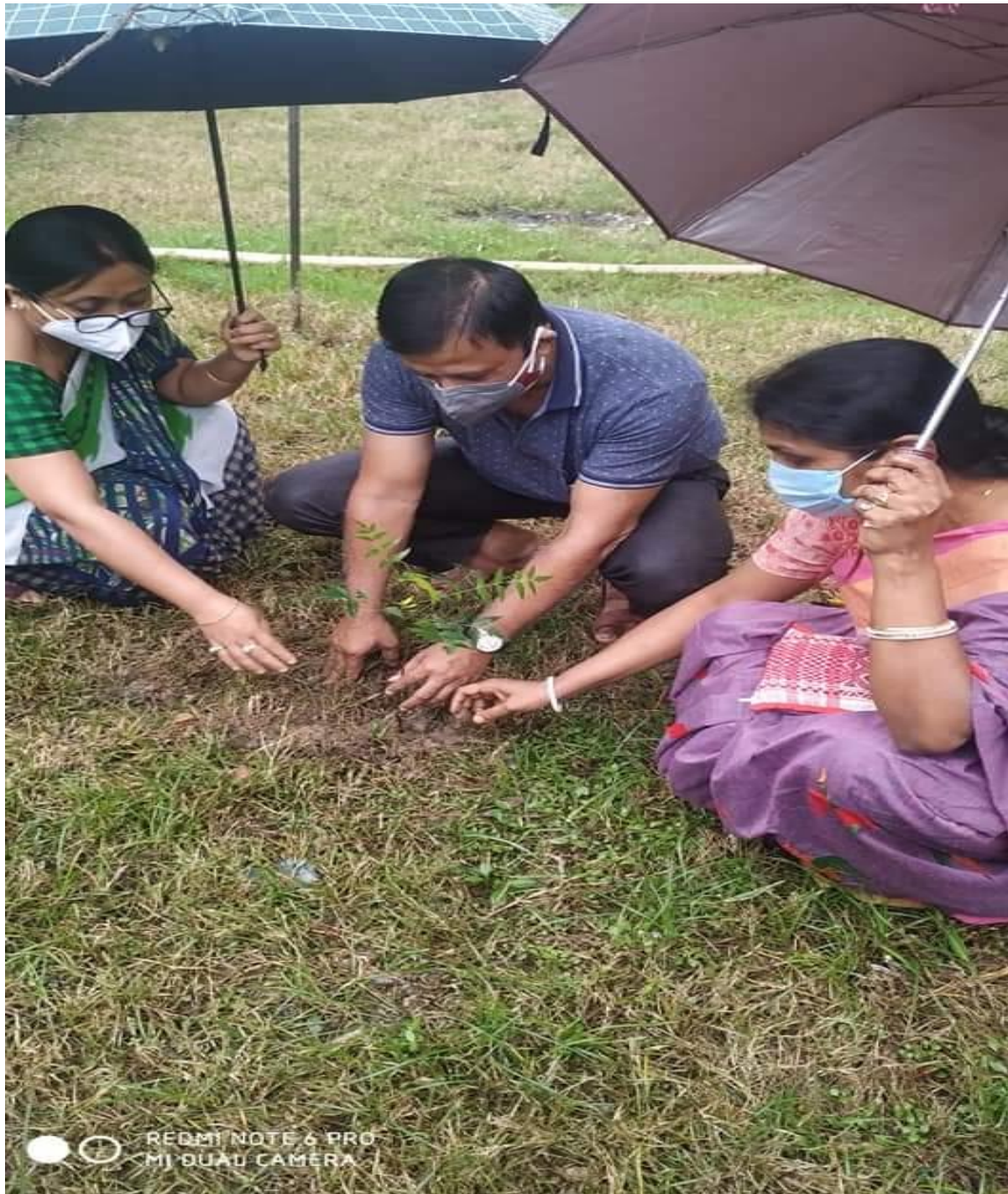
Observance of World Environment Day at Digboi Mahila Mahavidyalaya