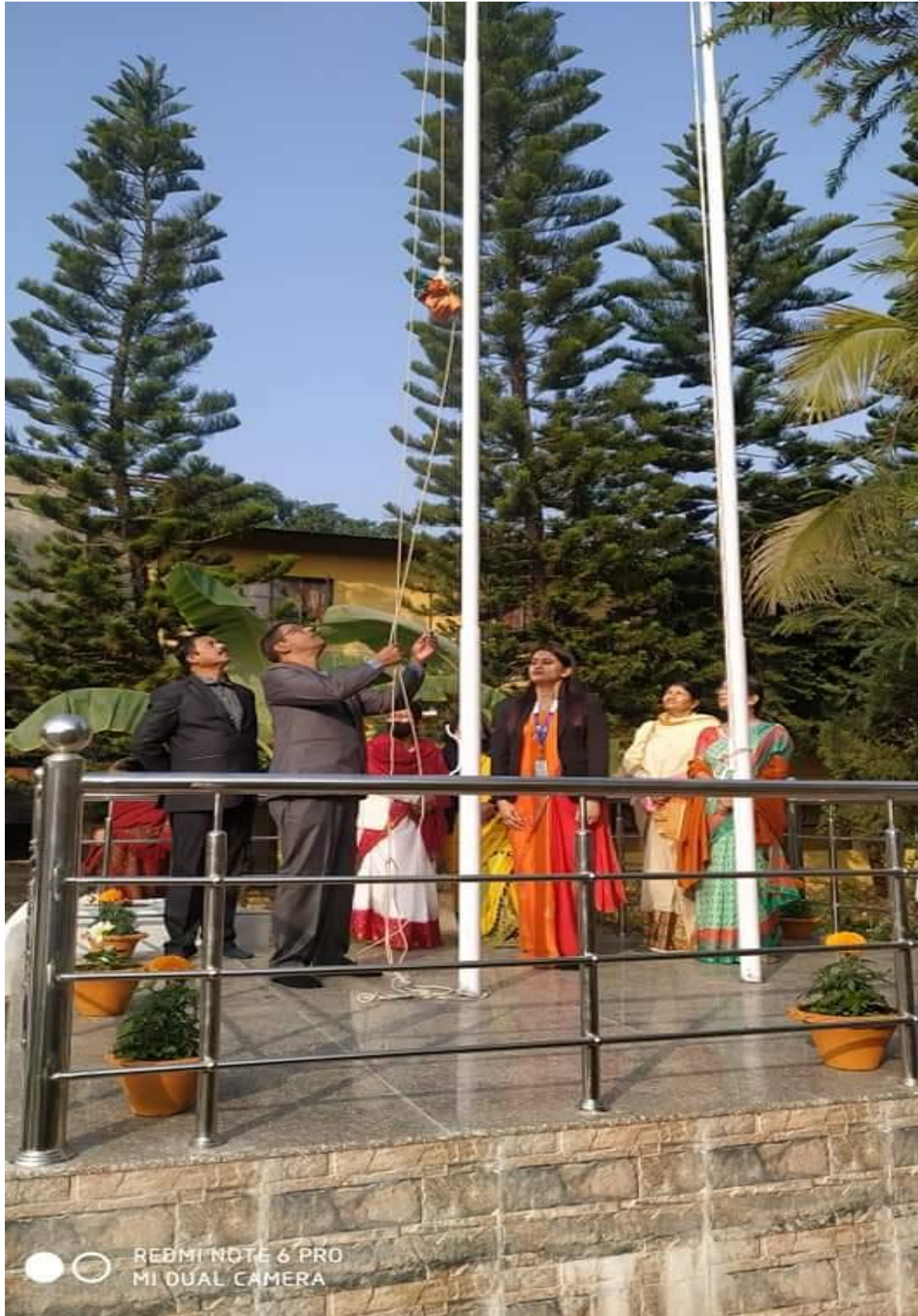
Celebration of Republic Day at Digboi Mahila Mahavidyalaya