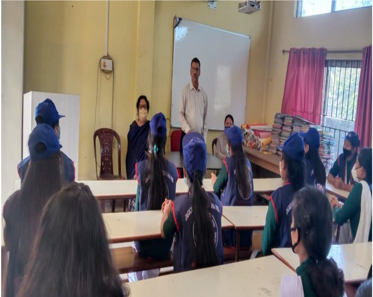
Observance of Constitution Day