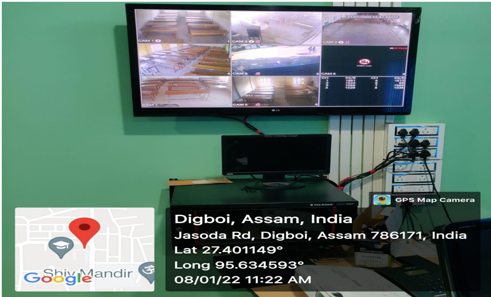
Figure 2 CCTV Surveillance