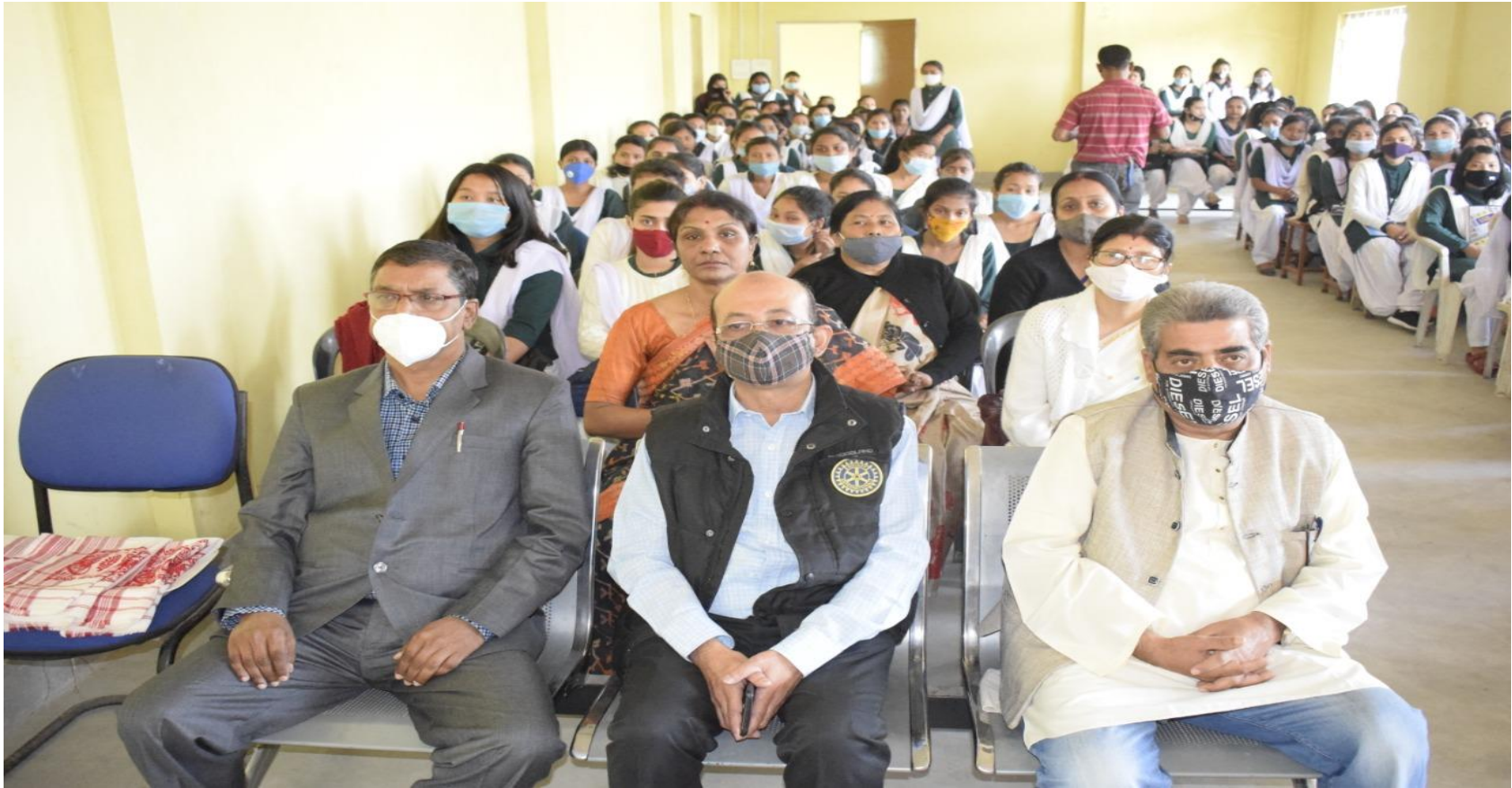
Figure 14 Interactive Session