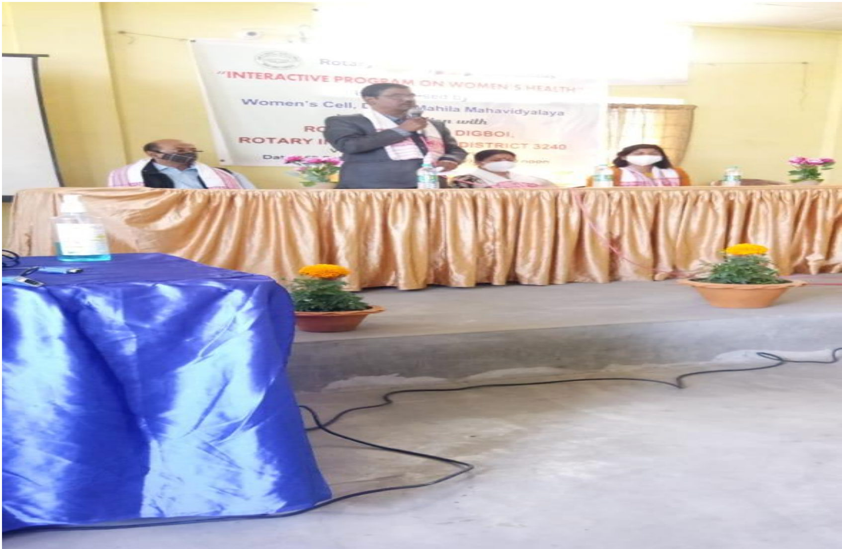
Figure 8 Interactive Programme on Women's Health