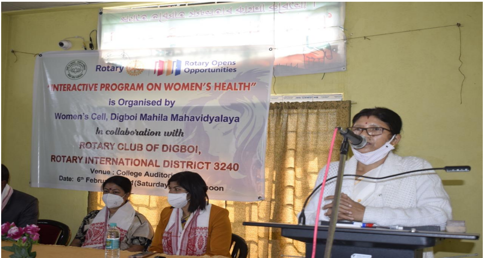
Figure 12 Interactive Session