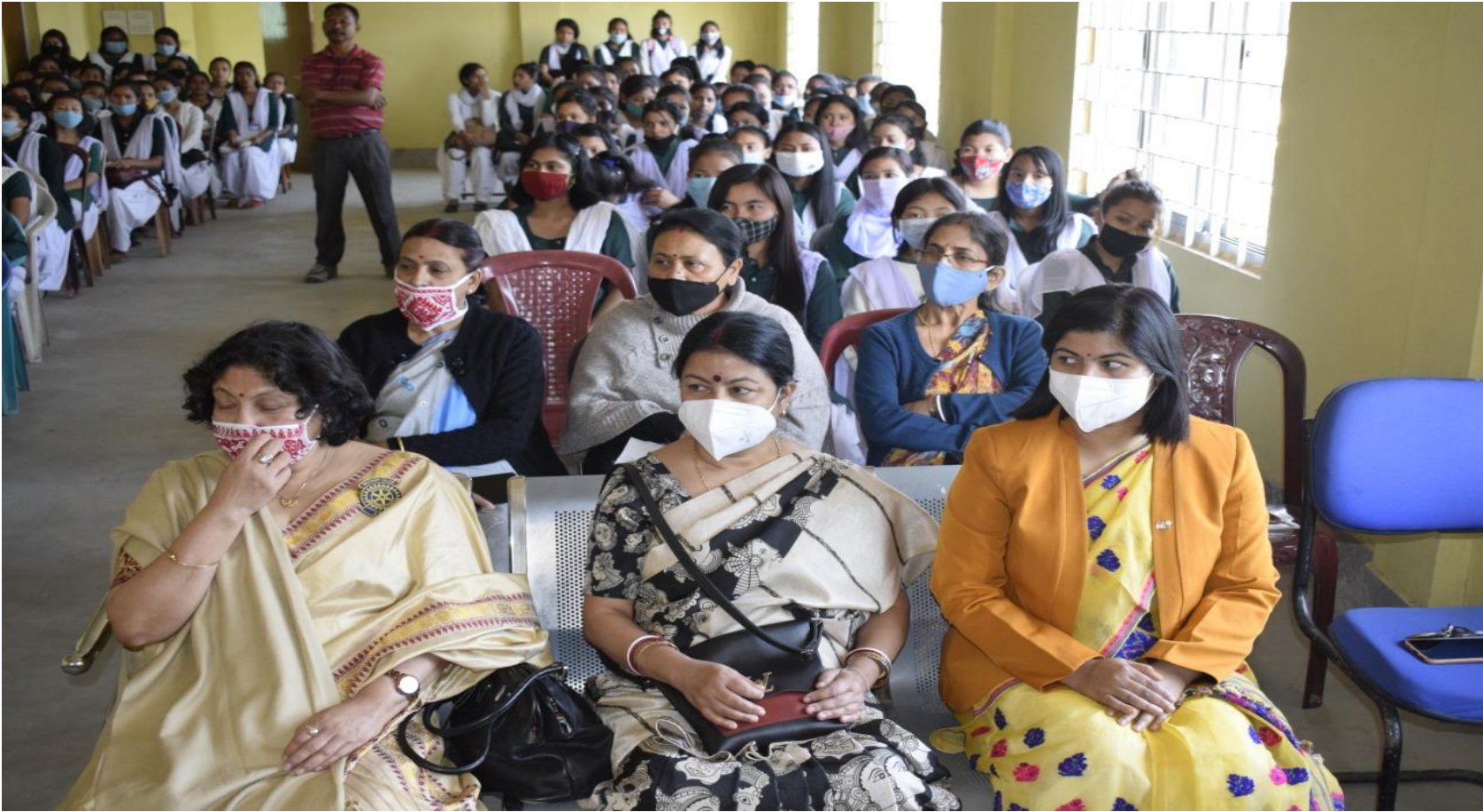
Figure 15 Interactive Session