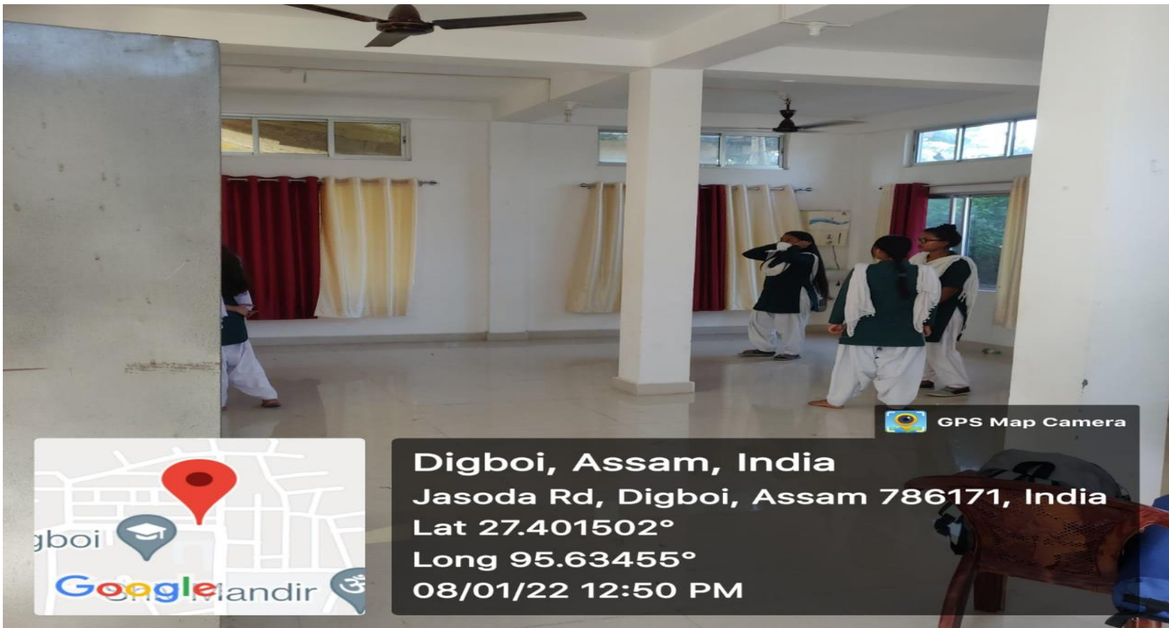
Figure 7 Students' Common Room