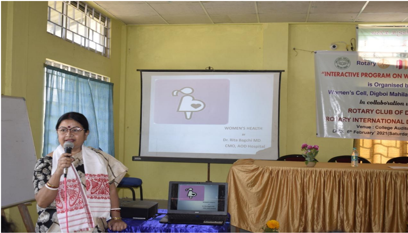
Figure 13 Interactive Session