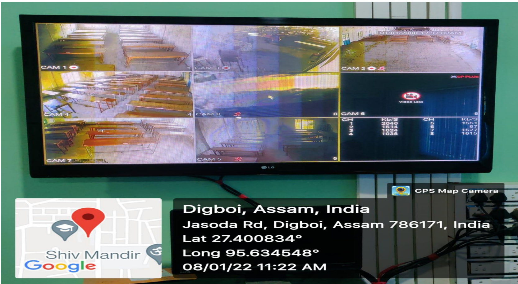
Figure 1 CCTV Surveillance