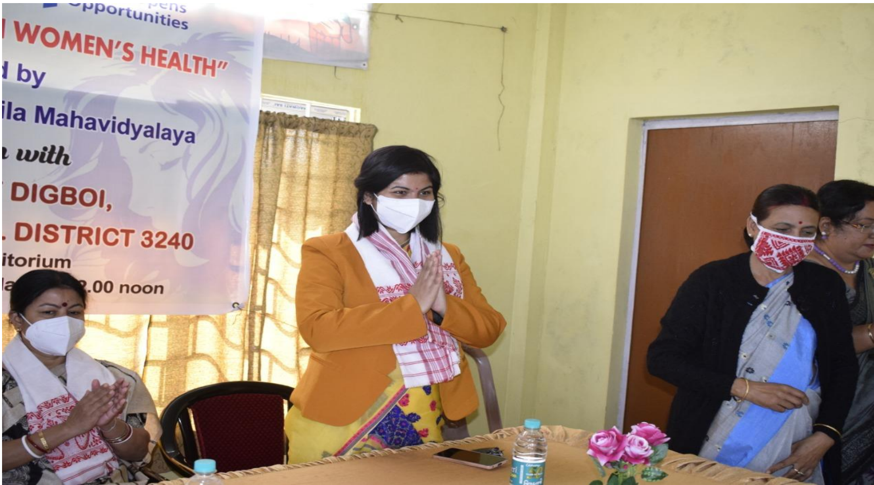
Figure 11 Interactive Session